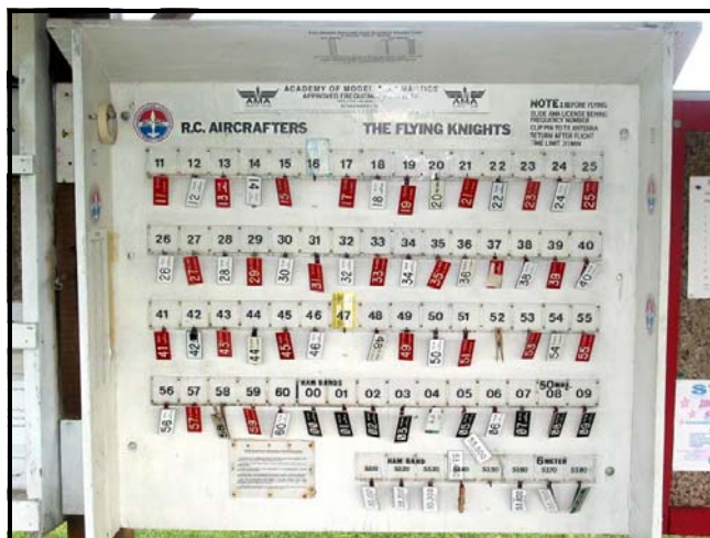
This tag board is used to ensure that RC aircraft fliers don't use a radio frequency already in use at the field.

STARS WB2EZU Memorial HF net meets at 10 AM local time on Saturdays on 3.925 MHz +/- QRM.