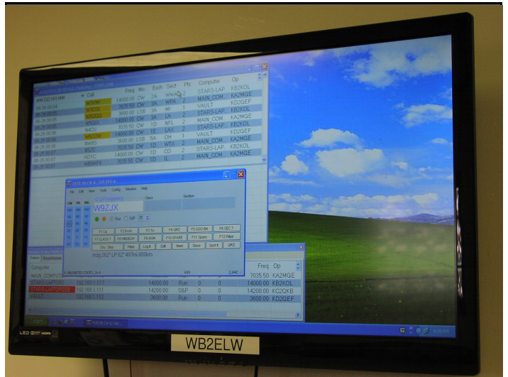
ABOVE: WALL DISPLAY OF THE N1MM LOGGING SCREEN