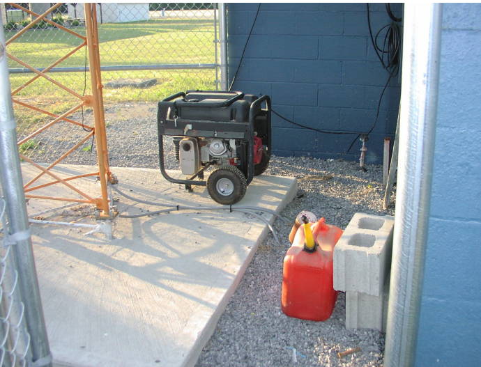
ABOVE: POWER GENERATOR

This year's point total is estimated to be 6850. That beats last year's total of 5000. Since we took first place in category 3E last year, it is expected that we will earn the same honor this year.