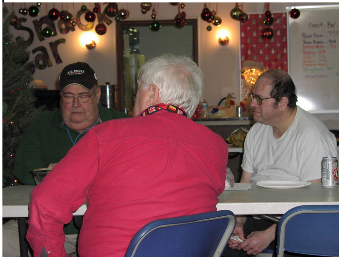
FROM LEFT TO RIGHT: