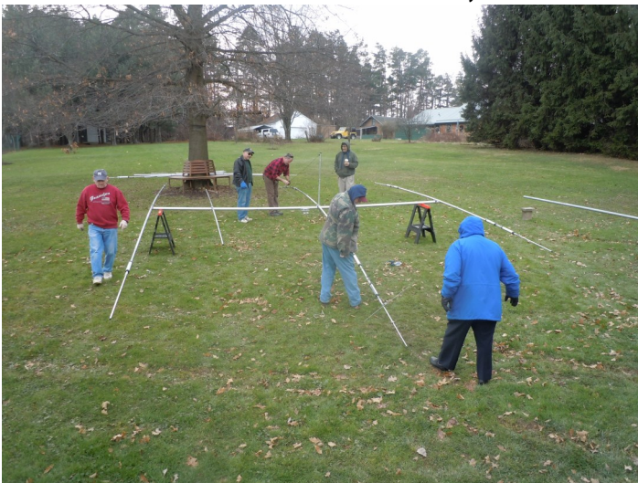
Adjustments are made to the A4S beam antenna.