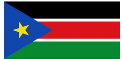
The flag of the Republic of South Sudan

At 10 AM (EDT) on Thursday, July 14, the UN General Assembly met to vote on whether or not to admit the Republic of South Sudan as its 193rd member state. The Republic of South Sudan was admitted by a vote of acclimation and is now a member of the United Nations. Immediately following the General Assembly meeting, the flag of the Republic of South Sudan flew for the first time in front of the UN, ceremoniously marking its membership in the UN. The membership of the Republic of South Sudan in the United Nations invokes DXCC status under Section II, 1 (a) of the DXCC rules . As such, the new country is declared a DXCC entity and QSOs for this new entity will be accepted immediately, with a start date of July 14, 2011.