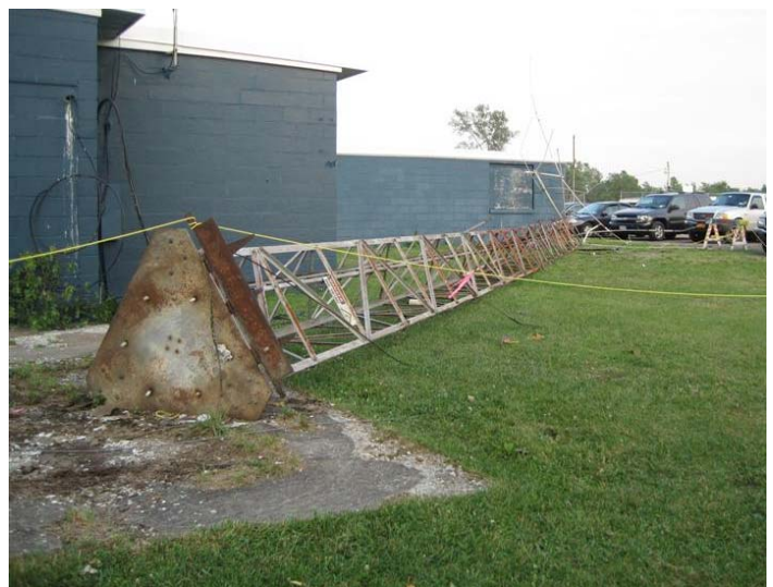
Another view of our downed tower.