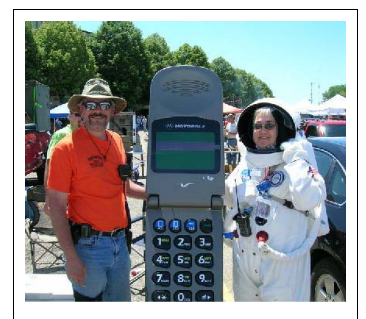
The things you see at the Dayton hamfest. This photo is just calling for a caption...

Send your caption suggestion to me (n2tez@msn.com) and I'll put them in next month's Telstar.