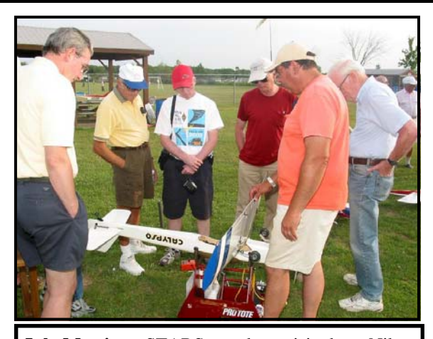
July Meeting: STARS members visited our Nike Base neighbors, the RC Aircrafters of WNY. See additional photos on pages 2 & 4 and at: www.pbase.com/k200/.

In case of bad weather, monitor STARS 147.090 MHz repeater for information on the status of the meeting.